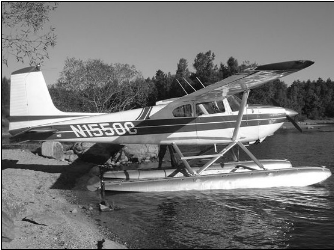
Members of the Maine Seaplane Association graciously donated use of a plane to assist aquatic invasive plant surveyors on remote lakes in northern Hancock County.

· In August, the District coordinated the third annual Hancock County Lake Survey Week for Aquatic Invasive Plants, with the assistance of 50+ volunteers performing Tier 1 (boat launch area) lake surveys over 50 access points throughout Hancock County. These areas continue to be targeted in the annual survey due to their high use and subsequent vulnerability to aquatic invasive plant infestation. Though no aquatic invasive plants have been discovered in Hancock County to date, the District will continue coordinating the annual Lake Survey Week, as early detection is the best defense against these environmentally and economically destructive plants - already a problem in Southern Maine. In preparation for the Lake Survey Week event, the following activities were also hosted by the District in August: