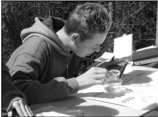
A student analyzes a water sample from a pond at the Aquatics Station during the Downeast Regional Envirothon in 2005.