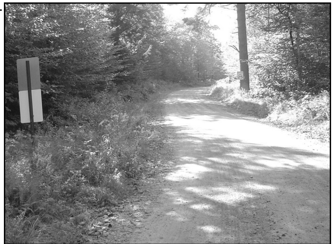
Before: A photo of Cove Way in the Branch Lake Watershed prior to road work. Notice the lack of proper ditching and extensive plant growth on the left side of the road.

· In May, HCSWCD assisted our sister District in Washington County during their hosting of the Downeast Regional Envirothon competition for nine high school teams from Hancock & Washington County. Students from Hancock & Washington counties compete in an exciting, day-long, outdoor event, testing their knowledge of environmental resources in Maine. Teams consist of 3-5 high school age students plus an advisor (parent, teacher, etc.). Many schools form teams from science clubs, FFA groups, classrooms, or simply a group of interested students. Working as a team, students test their knowledge of natural resource issues by answering questions and solving hands-on problems at five stations: Wildlife, Forestry, Soils, Water/Aquatics, and a Current Natural Resource Issue. The event was held on the grounds of the Jacksonville Campground in East Machias. To learn more about Envirothon, please visit www.maineswcds.org/envirothon.htm . In 2007, the Downeast Regional Envirothon will return to Hancock County, hosted by HCSWCD.