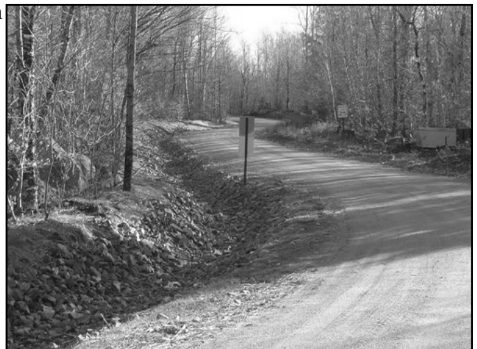
After: Cove Way with a 1300+ ft. rocked ditch installed, helping to direct rain/snow runoff away from the road surface, reduce erosion, eliminate road washouts, and help protect nearby lake water quality.